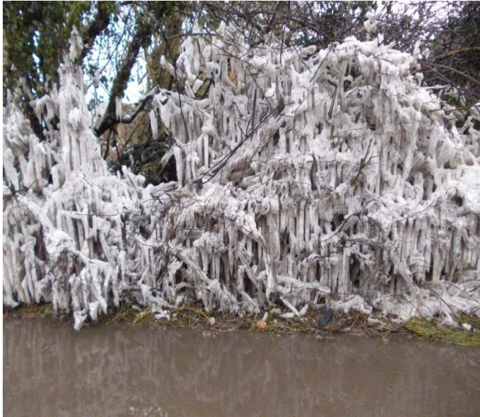
(Ice hedge in Swan Lane)

Download as a PDF file from the PC Website, read on your PC, Mac, Ipad, laptop even your smart phone