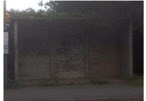
The old Bus Stop which was a safety hazard ↑ The old Bus Stop back in the 1960's ↓

Why have a new bus stop here? Well the old bus stop, which had been there since the 1960's, was becoming a Health and Safety issue, which crumbling concrete roof struts, plus the fact that now the number 10 bus stops here every hour and plus it's the National Express stop for people coming back from London or going to Dover.