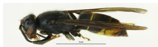
Asian Hornet more info inside

There is a bus stop outside the church or parking available in the lay-by parking area.