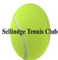
Sellindge Tennis Club