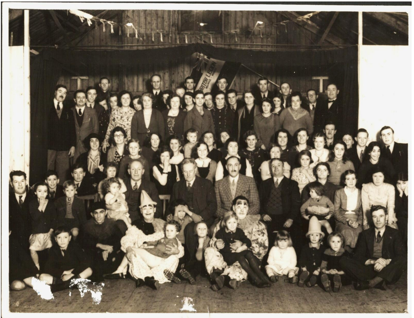
British Legion Party in Sellindge Village Hall 1948